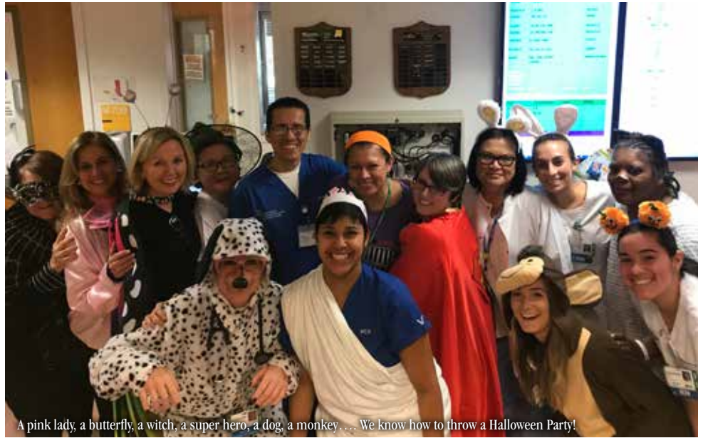
A pink lady, a butterfly, a witch, a super hero, a dog, a monkey.... We know how to throw a Halloween Party!