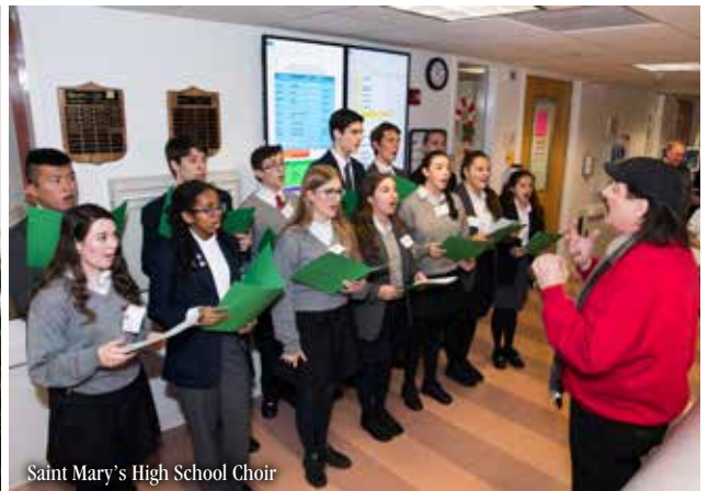
Saint Mary's High School Choir