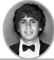
October 11, 1955 – June 21, 1972

For more information or to Donate Online, Please Visit www.donmontifoundation.org